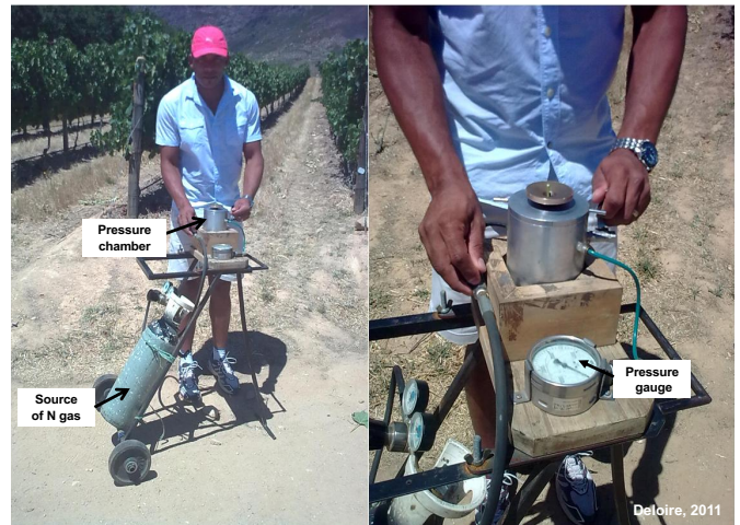
Figure 1. Example of a pressure chamber used to measure leaf water potential.

The reference method used today for addressing grapevine water status is the measurement of predawn leaf water potential (PLWP; \psi_{plwp} ), which is performed one to two hours before sunrise, when grapevine water status is at a maximum. Pre-dawn water potential measurements present the advantage of being stable, regardless of climatic conditions, and are closely linked to soil water status in the vicinity of roots. Threshold values for PLWP have been proposed by Carbonneau (1998) 2 , which makes it possible to evaluate the degree of water deficit